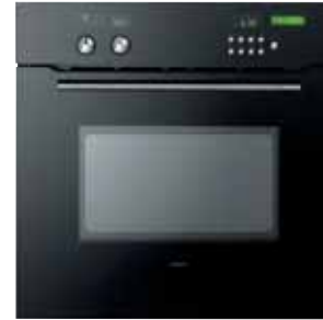
CX6011X Magna Design Line - Multi-System Turbo Oven with Combination Microwave function and Pyrolytic Cleaning