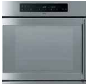
OX611T Magna Design Line - Stainless Steel Multifunction Turbo Oven