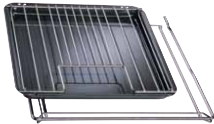
AO200B Meat tin with basket frame and grid