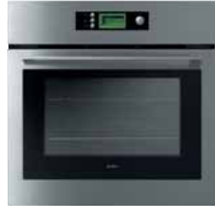
ZX6011Q Stainless Steel Multi-System Turbo Oven with Dot Matrix Menu, Easy Cook and Pyrolitic Cleaning