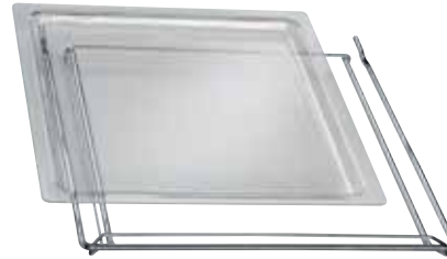
AO200A Glass tray and frame for shelf