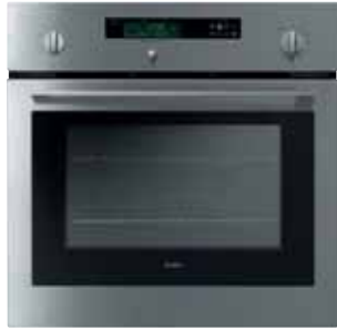
ZX6011N Stainless Steel Multi-System Turbo Oven with Easy Cook and Pyrolitic Cleaning