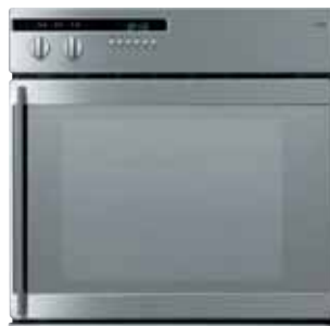
OX6011L Stainless Steel Multifunction Turbo Oven