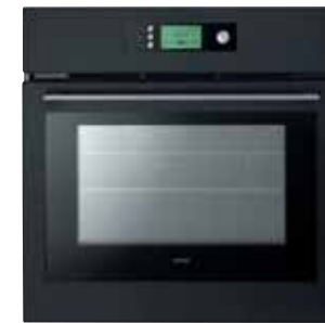
ZX6092Q Graphite Black Line Multi-System Turbo Oven with Dot Matrix Menu, Easy Cook and Pyrolitic Cleaning