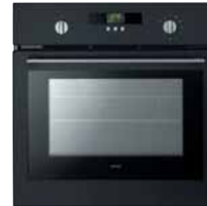
ZX6092K Graphite Black Line Multi-System Turbo Oven with Pyrolitic Cleaning