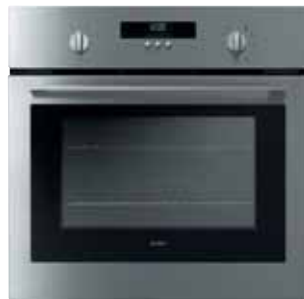
ZX6011K Stainless Steel Multi-System Turbo Oven with Pyrolitic Cleaning