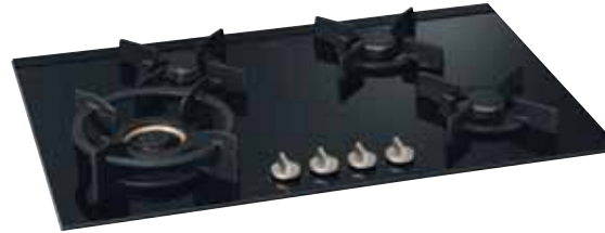
HG7111MT 800mm wide Magna Design Line - Gas on Glass hob