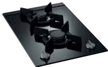
HG3111MT 330mm wide Magna Design Line Domino Hob - Twin A+ Burner Gas on Glass