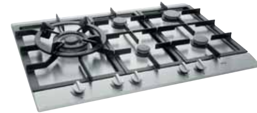
HG7611B 750mm wide Stainless Steel Gas hob