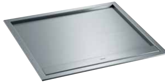
TY6011M 600mm wide Teppan Yaki Japanese style Grill Plate