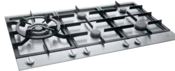
HG9611B Built-in solo gas hob 90cm