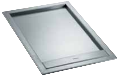
TY3011M 330mm wide Teppan Yaki Japanese style Grill Plate