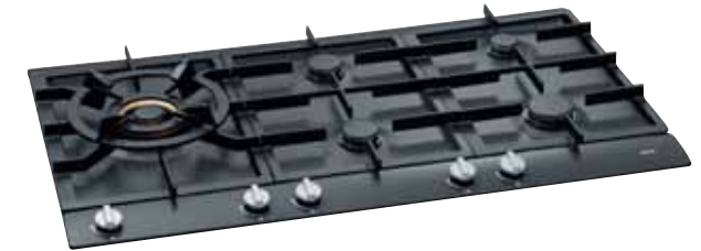
HG9692B 900mm wide Graphite Black Line Gas hob