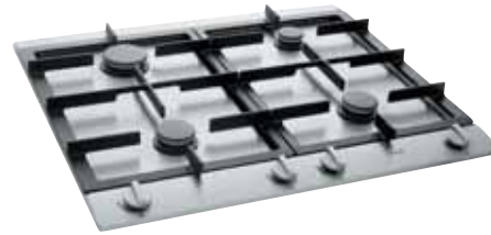
HG6111B 600mm wide Stainless Steel Gas hob