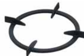
AWR200 Cast-iron wok support

For HG6111MT HG7111MT HG9611MT HG9611MTF