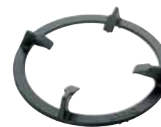
AWR100 Cast-iron wok support