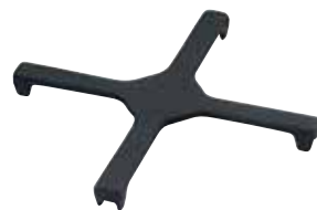
ASR200 Cast-iron simmer support

For HG6111MT HG7111MT HG9611MT HG9611MTF