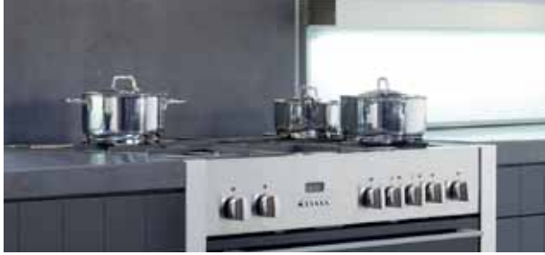
AA200D Stainless Steel Pan Set