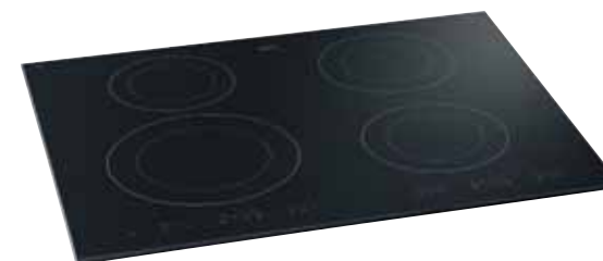
HI6071I 600mm wide Flush Fit - Touch Control Induction Hob