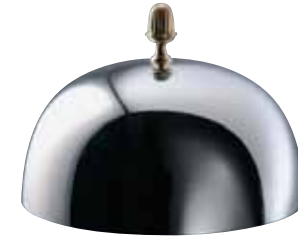
AH100A Cloche for teppan yaki