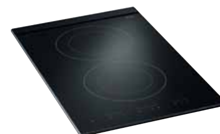
HI3171M 330mm wide Magna Design Line Domino Hob - Touch Control Induction