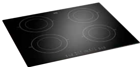
HI6071T 600mm wide Touch Control Induction Hob