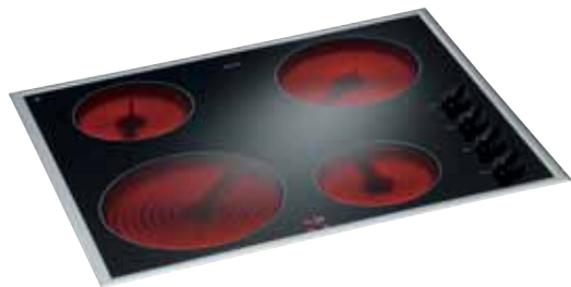
HL6011E 580mm wide Manual Control Ceramic Hob