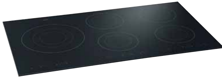
HI9071M 900mm wide Magna Design Line – Touch Control Induction Hob