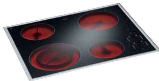
HL6011G 580mm wide Touch Control Ceramic Hob