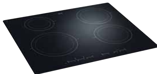
HI6071F 600mm wide Touch Control Induction Hob