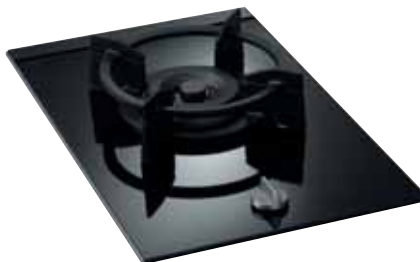
WO3111MTB 330mm wide Magna Design Line Domino Hob - 5.7kW Gas Wok Burner on Glass