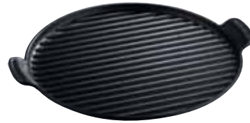
AG100B Griddle Plate