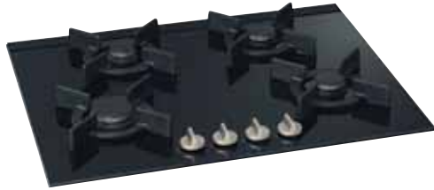
HG6111MT 640mm wide Magna Design Line - Gas on Glass hob