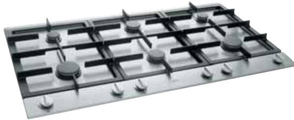
HG9111B 900mm wide Stainless Steel Gas hob