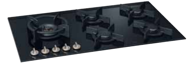
HG9611MT 900mm wide Magna Design Line - Gas on Glass hob