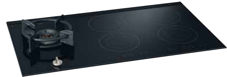
IG9071MTB 900mm wide Magna Design Line – Touch Control Induction Hob with 5.7kW wok burner